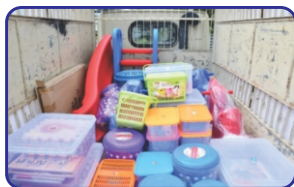
Mobile Toy Library - Ramakdu