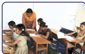
Hum Honge Kamyab - Literacy