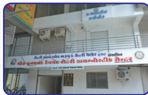
P.D. Shroff Rotary Diagnostic Center