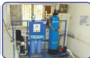
Clean Drinking Water