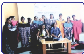
Women Empowerment Project