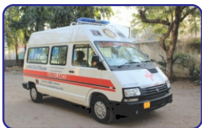
Ambulance & Morgue Vehicle