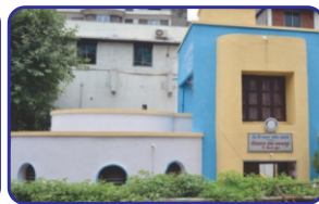
Pay & Use Toilet Blocks